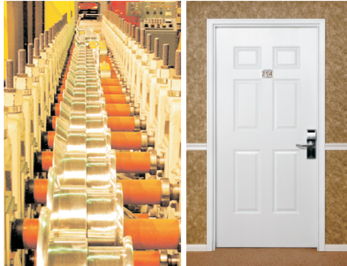
This 43 foot state-of-the-art roll mill at Timely's Pacoima, California, plant was designed specifically to produce the Frame-Up adjustable kerf steel door frame. Timely, an industry leader for over 30 years, is recognized as the originator of the prefinished drywall frame concept and widely respected for its innovative ideas, products and applications.