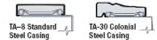
TA-8 Standard Steel Casing