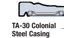
TA-30 Colonial Steel Casing

The TA-8 Standard steel casing enhances any commercial or residential setting. The TA-30 Colonial steel casing adds a special warmth for assisted living, motels and hotels, offices, apartments and homes. For steel casing, use our TA-18 retainer clips.