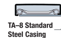
TA-8 Standard Steel Casing