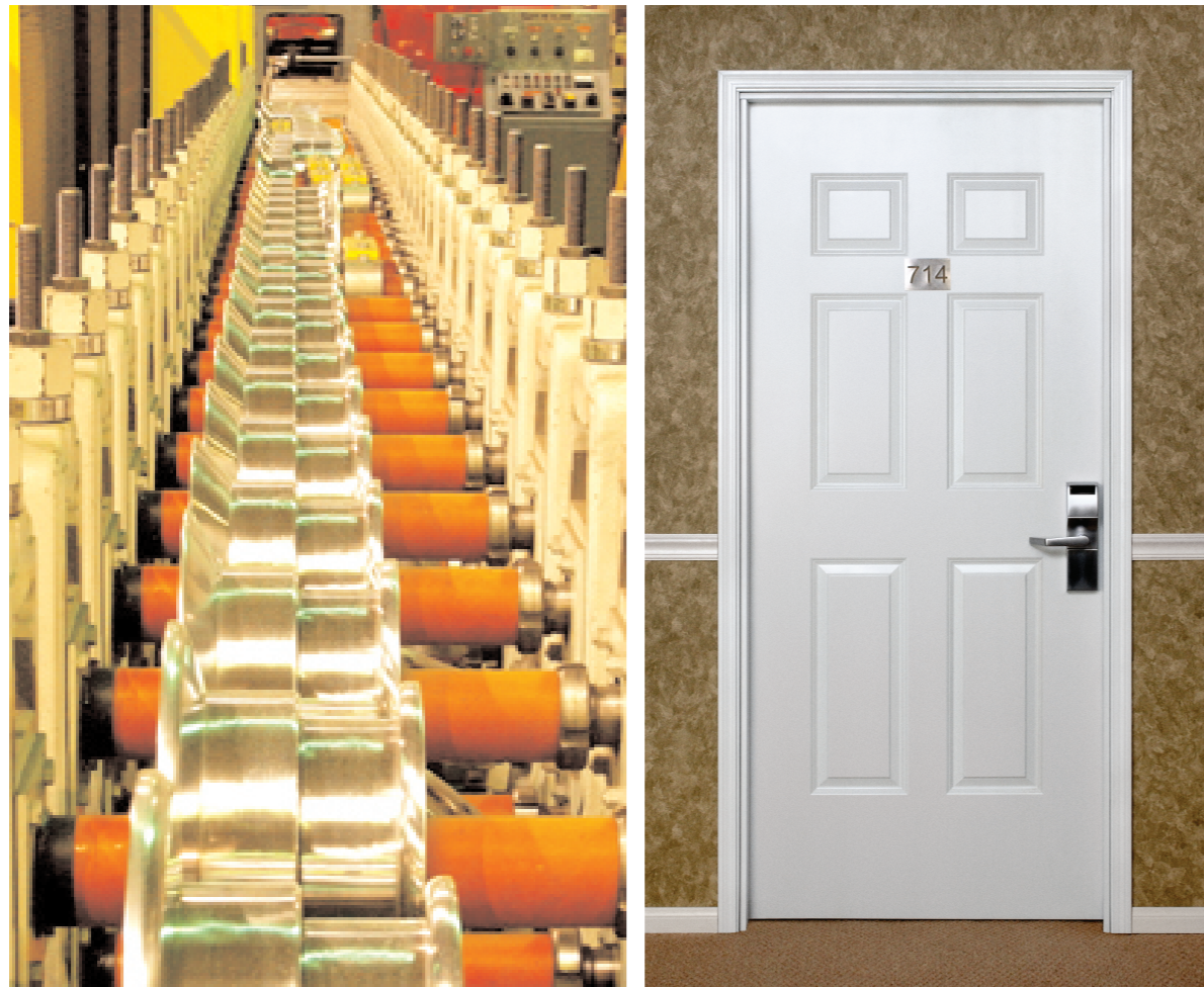
This 43 foot state-of-the-art roll mill at Timely's Pacoima, California, plant was designed specifically to produce the Frame-Up adjustable kerf steel door frame. Timely, an industry leader for over 30 years, is recognized as the originator of the prefinished drywall frame concept and widely respected for its innovative ideas, products and applications.